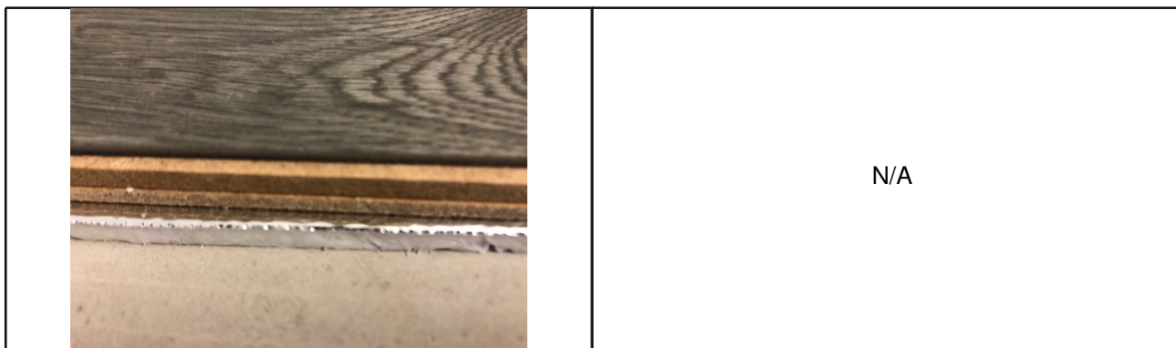
Illustration / drawing for sample assembly