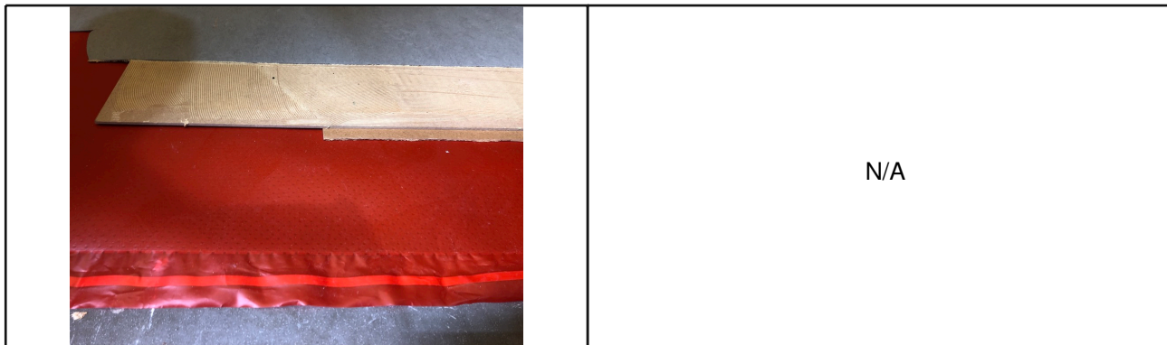
Illustration / drawing for sample assembly