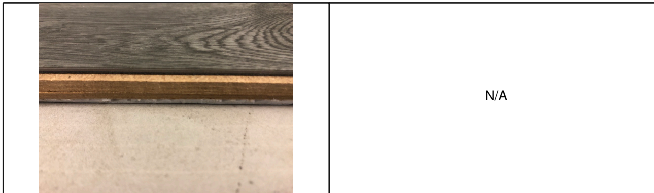
Illustration / drawing for sample assembly