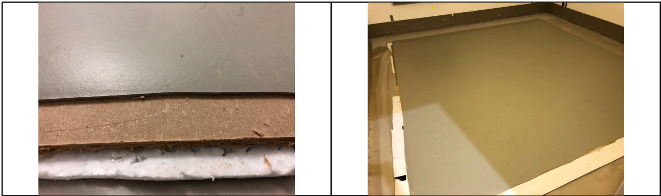
Illustration / drawing for sample assembly