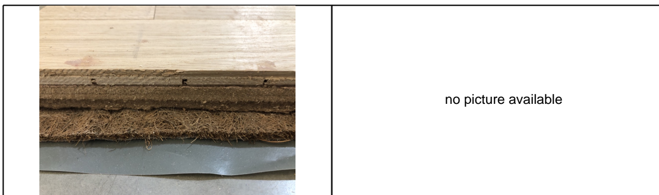
Illustration / drawing for sample assembly