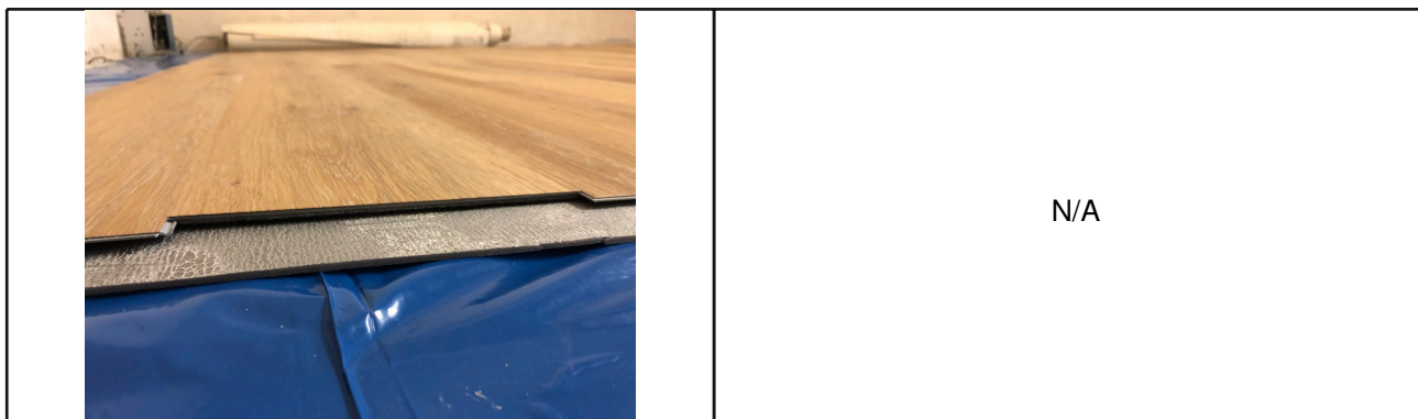
Illustration / drawing for sample assembly