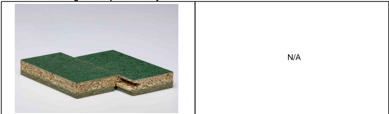
Illustration / drawing for sample assembly