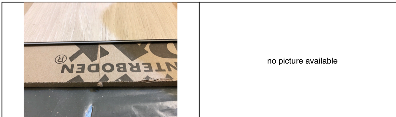
Illustration / drawing for sample assembly