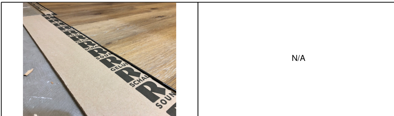
Illustration / drawing for sample assembly