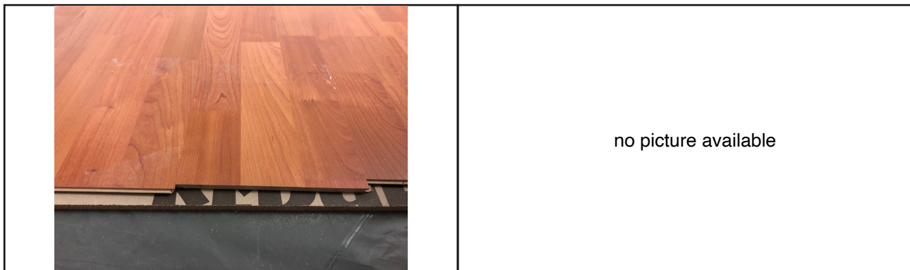
Illustration / drawing for sample assembly