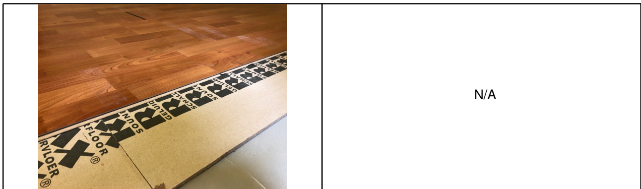
Illustration / drawing for sample assembly