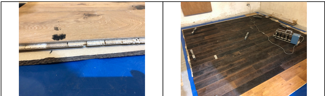
Illustration / drawing for sample assembly