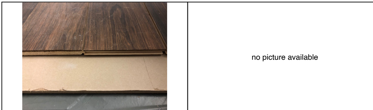
Illustration / drawing for sample assembly